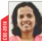
Dhodmise Trupti, IAS