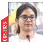
RAMYA RANGASWAMY IAS (AIR - 45)