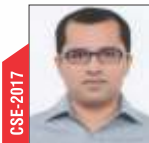
Badole Girish, IAS