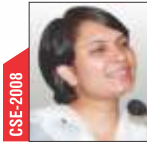
Sheetal Ugale, IAS