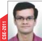
Amrutesh Aurangabadkar, IAS