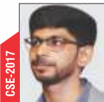
Piyush Salunkhe, IAS