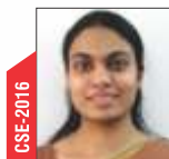
Vishwanjali Gaikwad, IAS